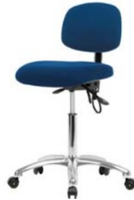
ESD & Cleanroom